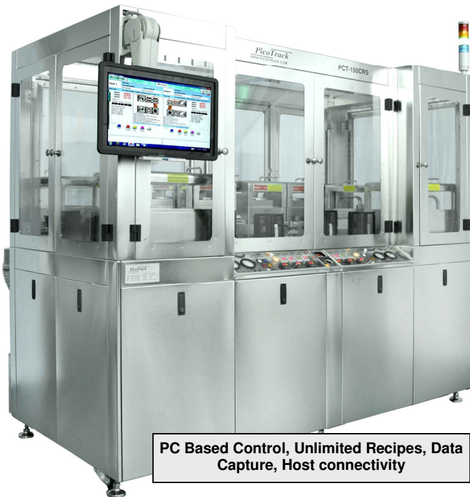
PC Based Control, Unlimited Recipes, Data Capture, Host connectivity

PicoTrack is a leading manufacturer of Coater-Developer tracks suitable for semiconductor and related substrates.